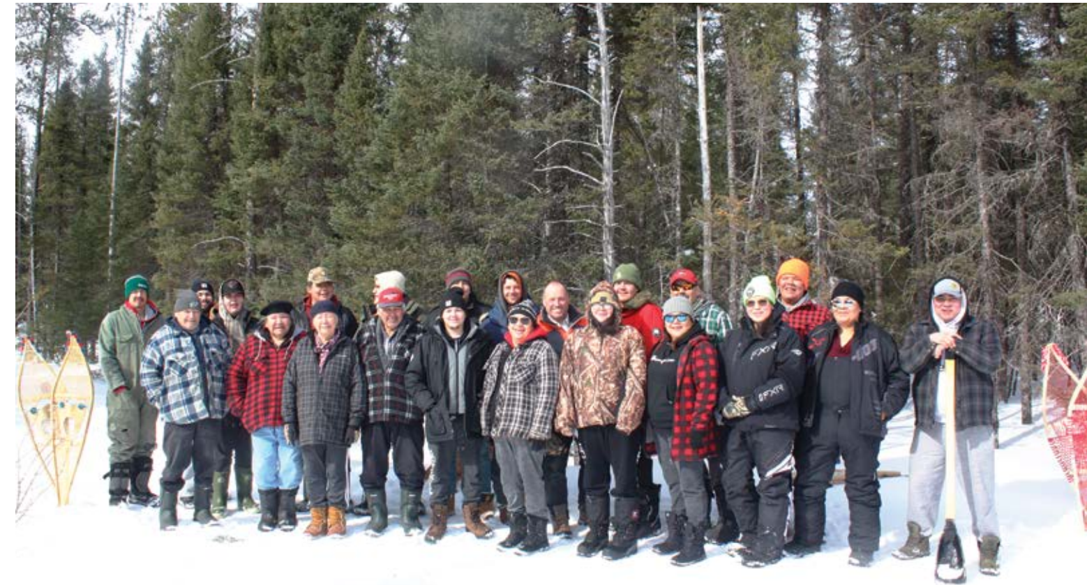
EEEYOU ITUUN PARTICIPANTS, CLASS OF MARCH 2022 AT KM 298 ON THE BILLY DIAMOND HIGHWAY.