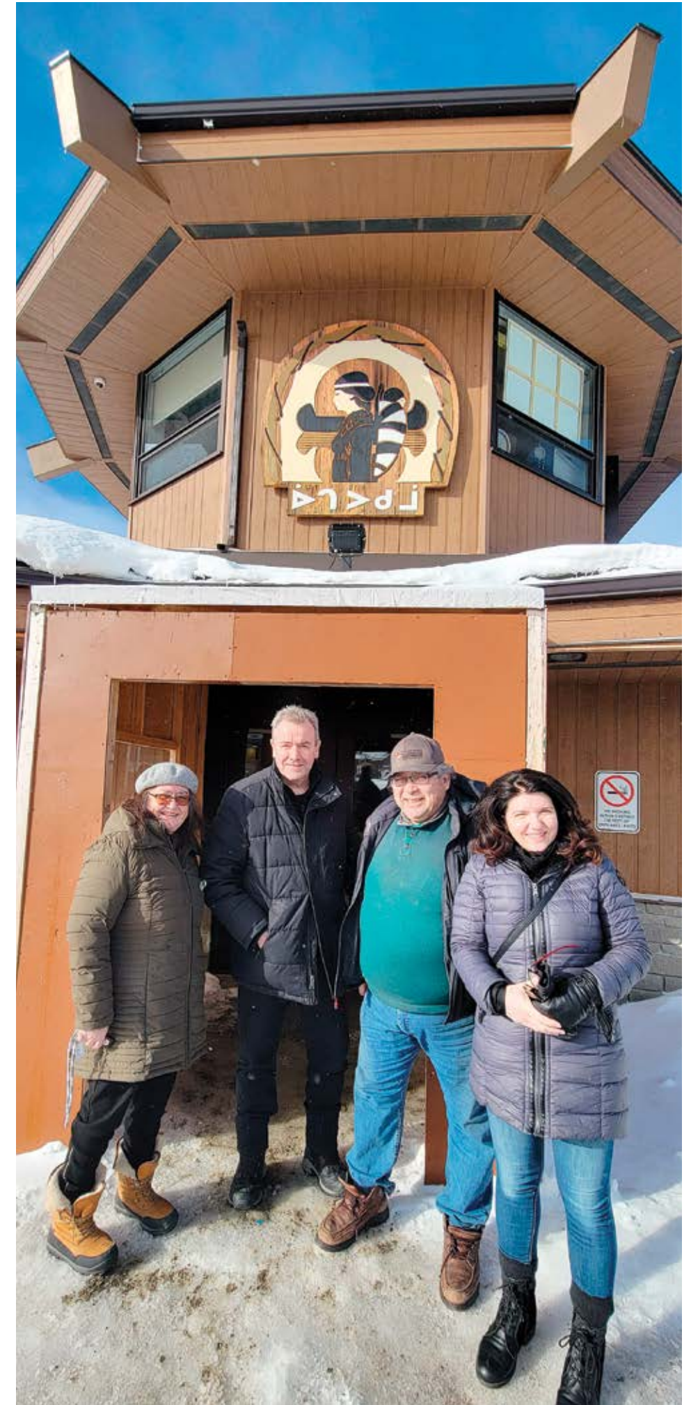
— OUJÉ-BOUGGOMOU FEBRUARY 2023