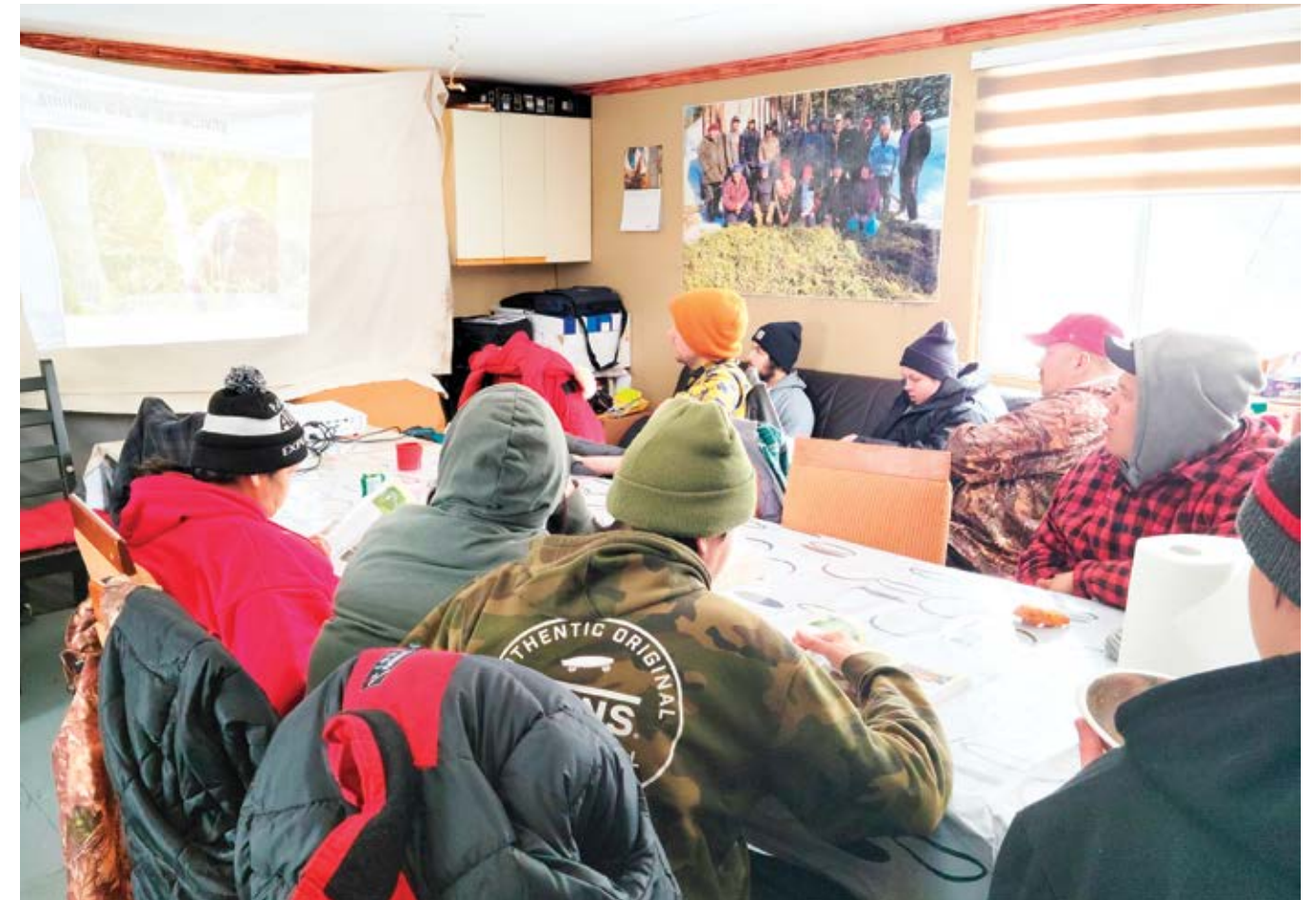
— EYYOU ITUUN / KM 298 BILLY DIAMOND HIGHWAY MARCH 2022