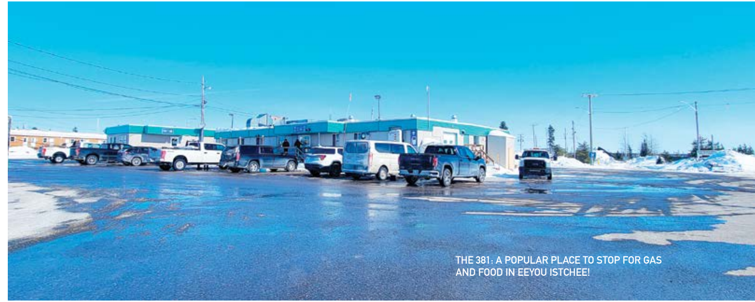
THE 381: A POPULAR PLACE TO STOP FOR GAS AND FOOD IN EYYOU ISTCHEE!