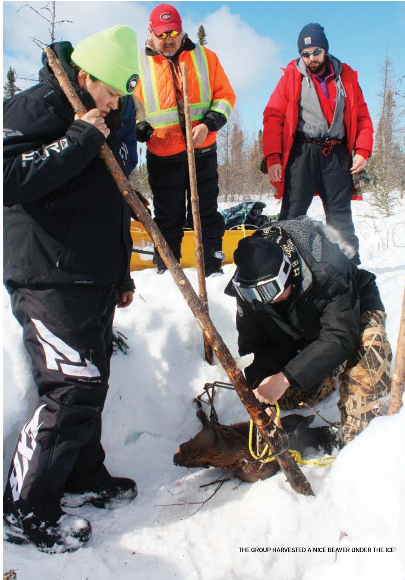
THE GROUP HARVESTED A NICE BEAVER UNDER THE ICE!