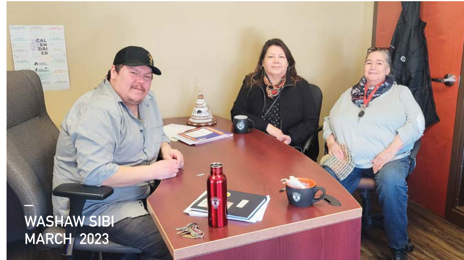
WASHAW SIBI MARCH 2023