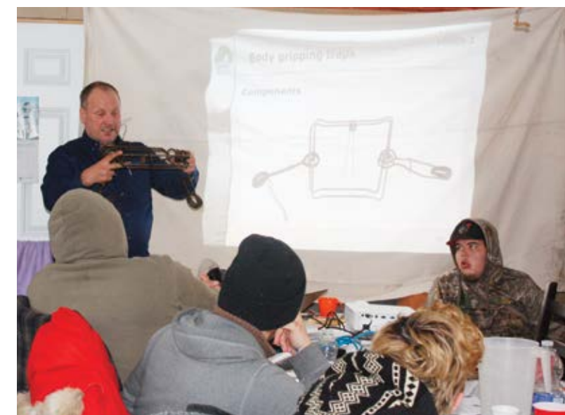
PROGRAMME EEYOU ITUUN MARS 2022

À propos du mode de vie cri, vous verrez dans ce numéro toute une série de photos que j'ai prises lorsque j'ai rendu visite aux étudiants du programme Eeyou Ituun. J'ai l'intention de rendre visite à la classe de cette année également, alors ne soyez pas surpris si vous me voyez bientôt à Eeyou Istchee!