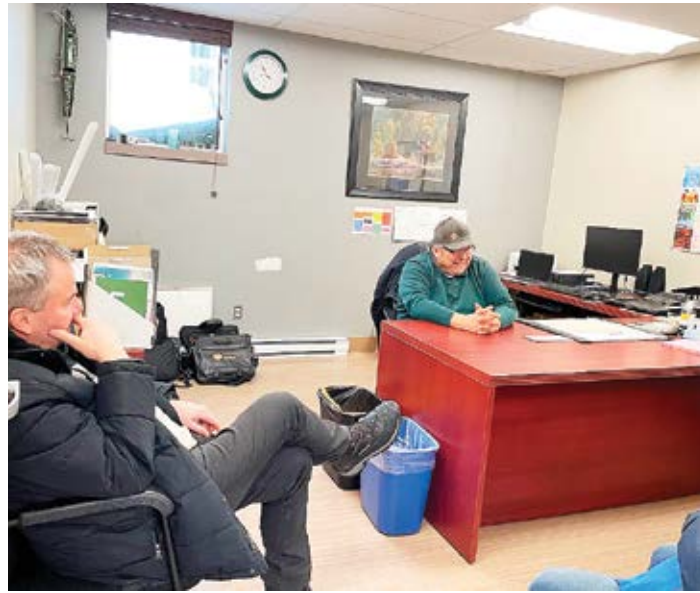
— STAFF TRAVEL MISTISSINI FEBRUARY 2023