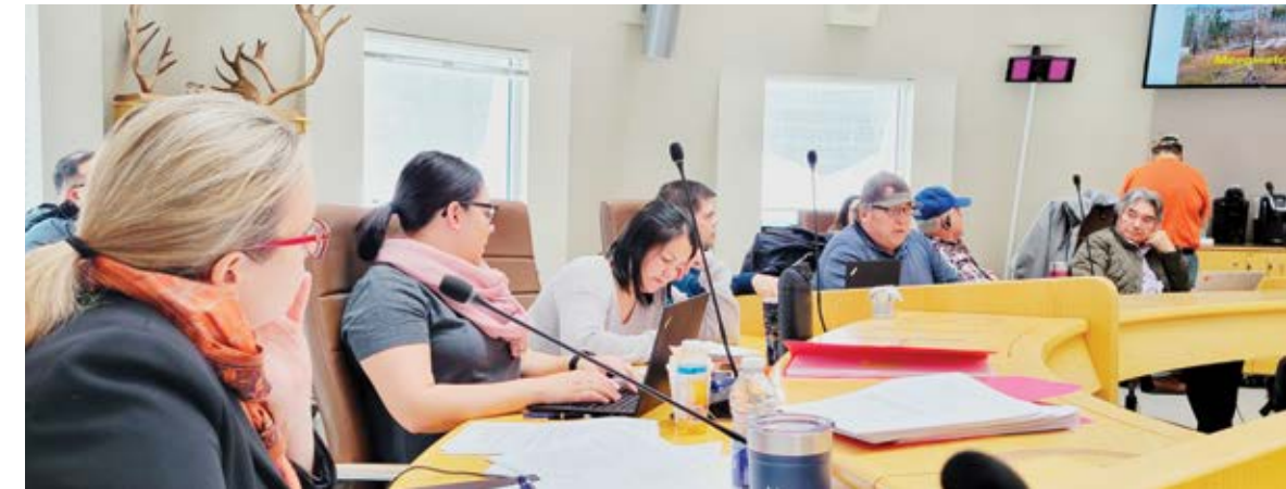
MEETING ABOUT THE ECONOMIC SECURITY PROGRAM WITH THE CHIEF DAISY HOUSE AND THE COUNCIL IN CHISASIBI.